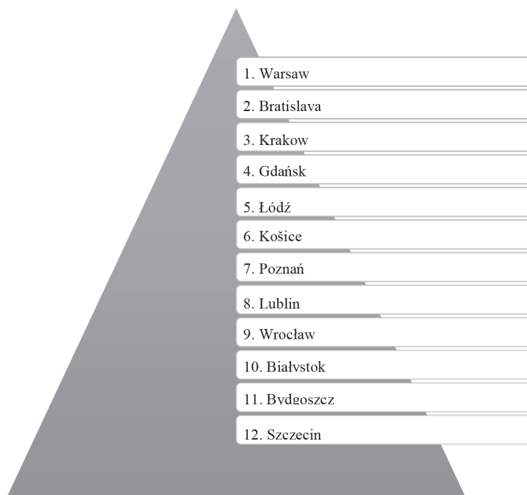
Figure 1: Ranking of the use of environmentally friendly solutions in local public transport in the cities surveyed in 2020